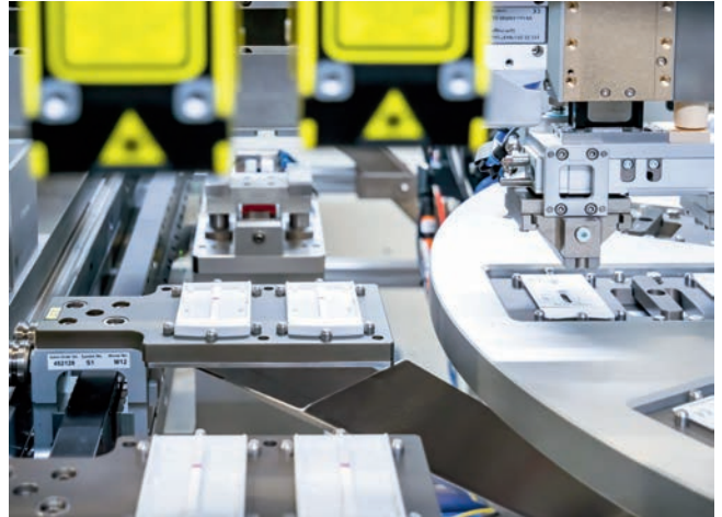
Inline process testing ensures product quality at all times.