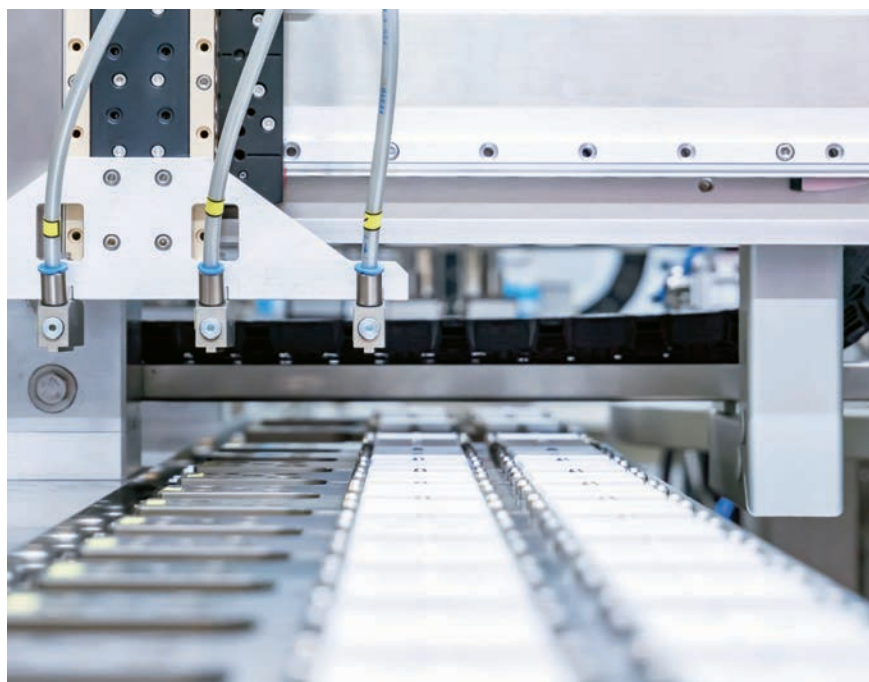
Assembly time 750 ms: the rapid transport of individual parts – here the lower shells – is the prerequisite.

A closely controlled press force combines the upper and lower parts to form a finished test cartridge. Subsequent inspection checks monitor whether everything has been assembled correctly. The last vision inspection verifies correct labeling and then the finished tests leave the machine via a conveyor belt leading to a primary packaging. At this point, in addition to the test cartridges, drying agents and any necessary pipettes can be added and contents can be welded in bags. »