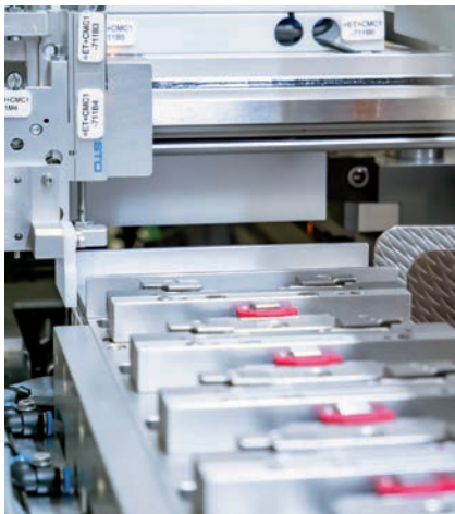
Cutting station: it makes individual test strips from card material and automatically sorts out faulty parts.

The basis for this is utilization of MA micro automation's Ceres POC system, which can assemble test cartridges with up to three test strips – in just 750 ms per cartridge. Sanner can now offer customized or standard cartridges, which can accommodate the needs of many customers. The precise fit of component parts is important in order to achieve an effective lateral flow, the uniform spreading of a test sample along the reagent coated test strip.